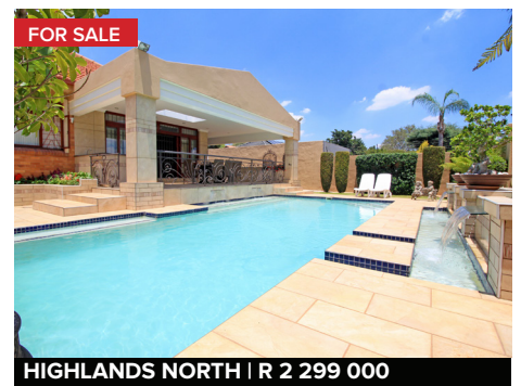
🛱 1.5 ≔ 3 Web Ref: JRL26903 Stunning Pristine Home with Exceptional Features. Three

spacious bedrooms, a full bathroom, and a guest toilet. Entertainment patio overlooks landscaped garden and sparkling pool with a water feature and coloured lights. Well-fitted, eat-in kitchen. Additional features include staff accommodation, a solar system, and excellent security.